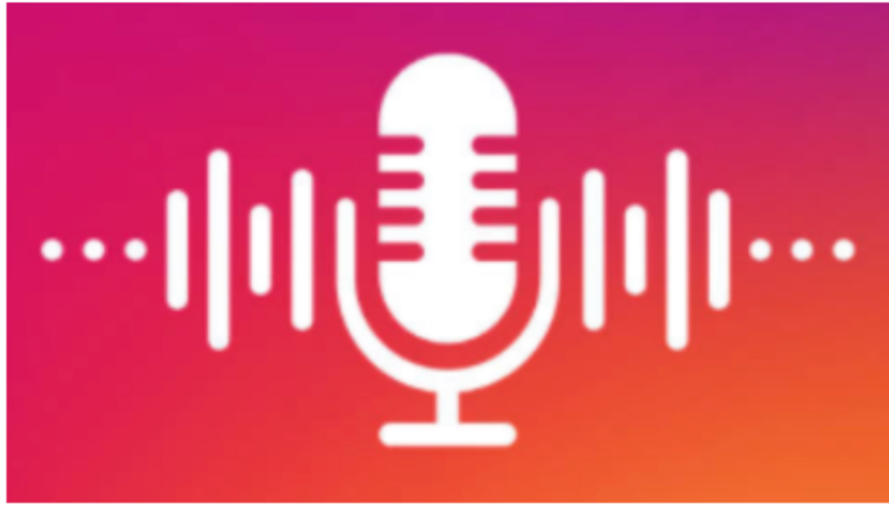
A podcast image

Podcast Series 'The Art of Medicine: Love of Humanity' available here . In this podcast series we talk to activists and researchers with learning disabilities who tell us about the ways in which they have tried to push for humanising healthcare